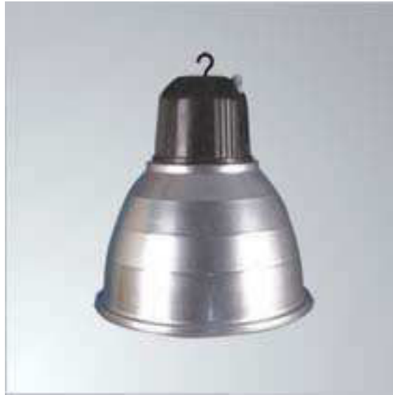
Relative intensity \pm 25^\circ